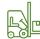
ITSSAR, RTITB and NPORS Accredited Mechanical Handling Equipment Training