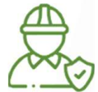
NEBOSH General National Certificate in Occupational Safety and Health