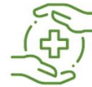
Health and Safety Consultancy